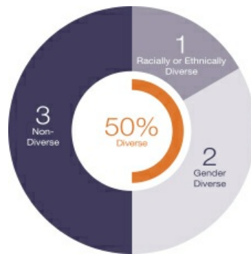
BOARD DIVERSITY (following the Annual Meeting)